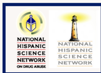
Previous NHSN logos

What started as a conversation over two days in 1999 has evolved into a thriving network that continues to champion Hispanic/Latino voices in research by creating community, fostering mentorship, and shaping the next generation of scholars.